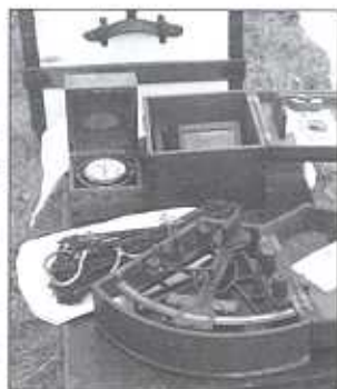
chronometer, chain, sextant

Early this summer, technically late spring, I was invited to Bent's Old Fort in Southeastern Colorado to participate in their Living History Encampment. This experience will be remembered and treasured as one of the highlights of my life. Let me start with a little background history.