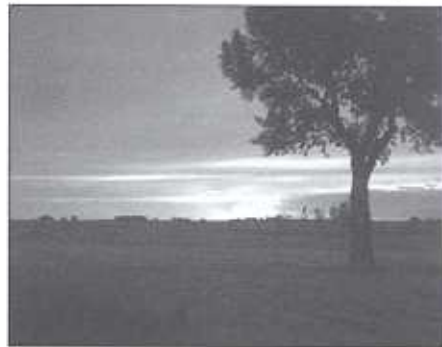
Colorado Sunset at Bent's Fort